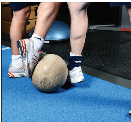
FIGURE 5. Block tackles at different angles and intensities, on different types of surfaces, from a soft deflated soccer ball to a harder leather medicine ball.