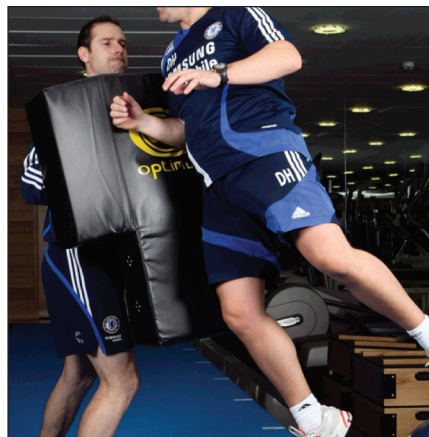
FIGURE 7. In-air body contact, trying to simulate heading and body contact in the gym environment. Specific instructions are given on landing correctly on the forefoot/toes and absorbing the landing forces. Progressions can be added by different directional forces and intensity of body weight contact.

Often, the level of contact of the sport is overlooked in the rehabilitation program and left to players to manage as