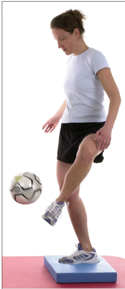
FIGURE 2. Female amateur soccer player on foam pad (passing back the soccer ball with nonoperated leg).

The rehabilitation may arbitrarily be divided into 4 phases: (1) protection and controlled ambulation, (2) controlled training, (3) intensive training, and (4) return to play. 7,8 The time frame for each phase varies depending on the surgical procedure and individual response to treatment. The overall guiding principle is that the program should be soccer spe-