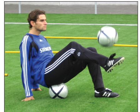
FIGURE 3. Male professional soccer player sitting on a soccer ball (and juggling another ball).

Myer et al 34 presented a criteria-driven progression through the return-to-sport phase of rehabilitation following ACL reconstruction. The authors proposed objective assessments of strength, stability, balance, limb symmetry, power, agility, technique, and endurance to guide the athlete back to sports. Recently, Impellizzeri and Marcora 23 critically discussed the validity of physiological and performance tests in sports. As the focus of this paper is on functional rehabilitation, we will not cover the assessments for all phases in detail but, rather, provide updated evidence-based and clinical-expertise guidelines.