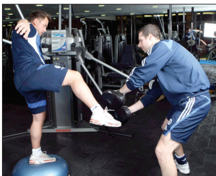
FIGURE 6. Kicking action into pads while balancing on an unstable surface, incorporating standing balance while making contact. The use of unstable surfaces helps to promote different reactive stabilization strategies.

Contact Situations One aspect of the later sport-specific drills is contact, which is a major element of the game of soccer. Although ACL ruptures tend to occur more often without contact, 42 those occurring from contacts cannot be ignored. Roi et al, 44 analyzing data from the Italian Serie A League, determined that ACL contact injuries occurred more frequently during competitive games, while noncontact injuries occurred more often during training and nonofficial games. Mihata et al 32 compared a number of different sports (basketball, soccer, and lacrosse) and suggested that the level of allowed contact in pivoting sports may be a factor in determining sport-specific ACL risk.