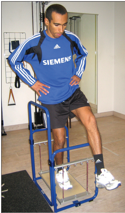
FIGURE 1. Male professional soccer player on swinging platform (simulation of kicking ball with nonoperated leg).

perspective on a return-to-play model to prepare soccer players to compete after ACL reconstruction.